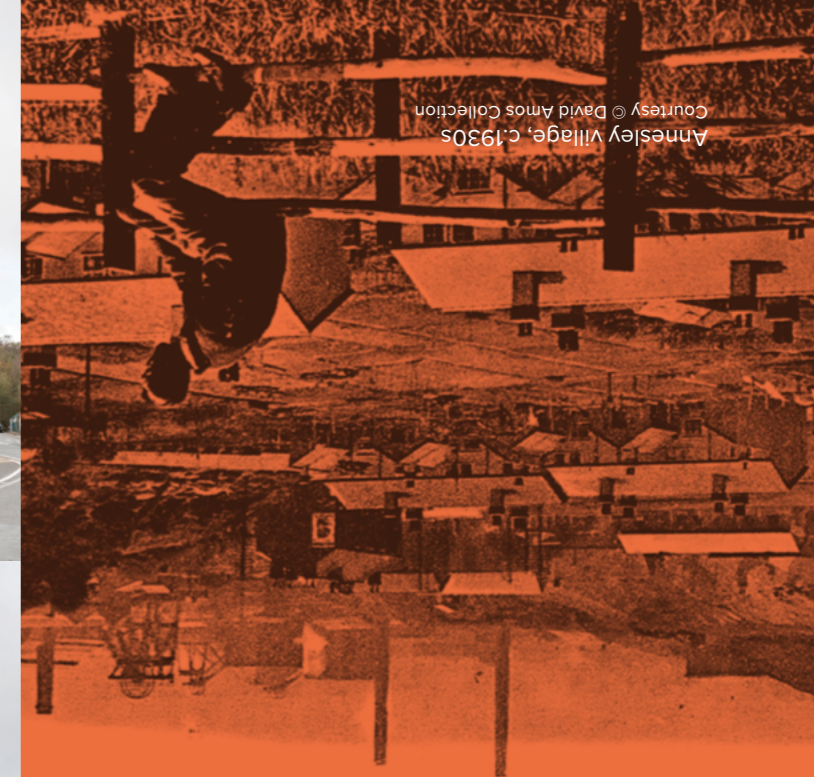
Annesley Village, c.1930s