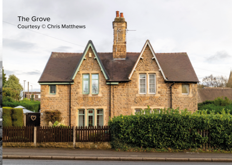
The Grove