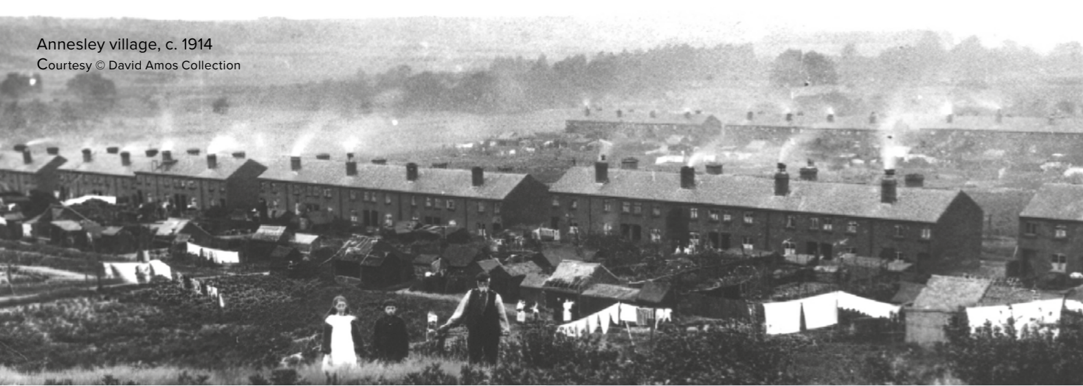
Annesley village, c. 1914