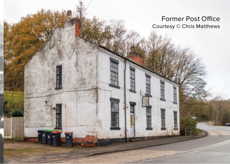
Former Post Office